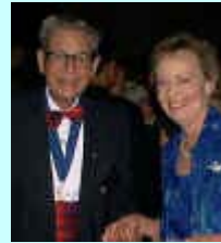
San Antonio, Texas August 2002